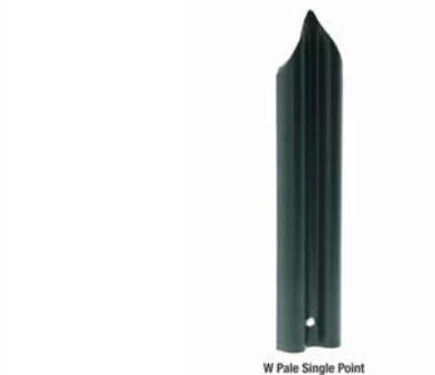
W Pale Single Point