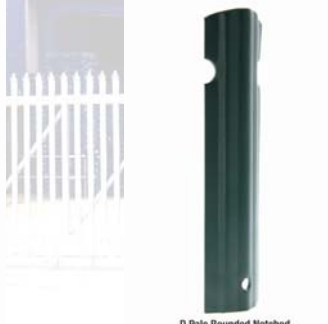
D Pale Rounded Notched