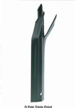
D Pale Triple Point