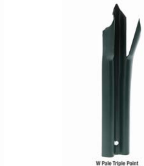
W Pale Triple Point

Paramount Steel Fence, Florida Close, Hot Lane Industrial Estate, Burslem, Stoke On Trent www.steelfence.co.uk Telephone 01782 833333 Fax 01782 832222