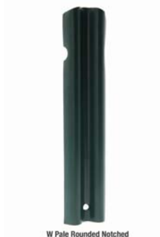
W Pale Rounded Notched