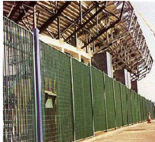
Fencing supplied to Murrayfield Stadium

Designed to be strong and durable with an attractive visual appeal.